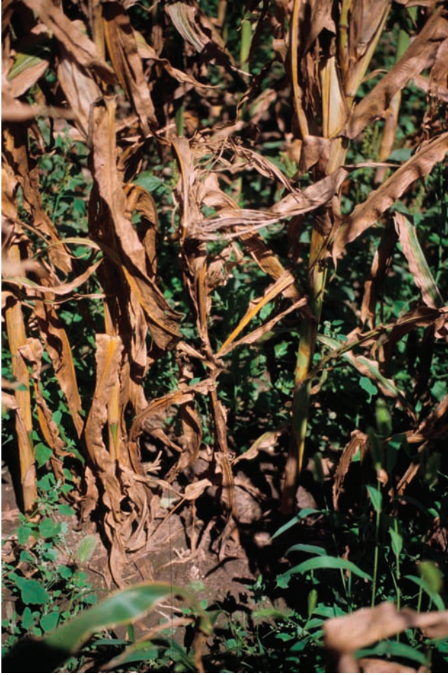
Figure 6 Premature death of plants can occur when seedlings are systemically infected. Loss of plants prevents canopy closure, allowing excessive sunlight to penetrate the canopy, thus weeds flourish. Some monocot weeds may provide a reservoir for inoculum spread and survival, making weed control important in managing Goss's wilt and blight.

period of time. Burial of infested residue inhibited recovery of the bacterium from all plant parts except for infested stems, which yielded low levels of the pathogen. Pathogen spread throughout fields is enhanced by continuous corn production and injury to leaves caused by factors such as sand blasting, heavy winds or especially hail ( Figure 7 ). Insects are not known to be involved with disease spread or development. Disease has been observed from both dryland and irrigated production fields. Once infection occurs, optimal temperature for disease development is 80°F, and all plant parts may serve as sites for infection. Hot, dry weather can impede disease development, except in overhead irrigated corn.