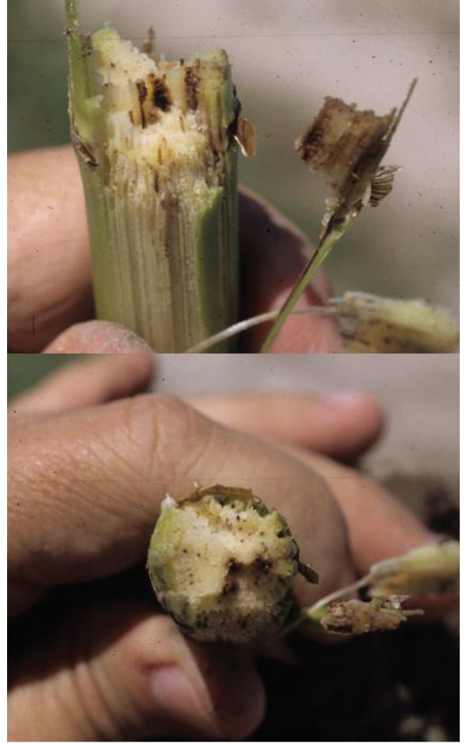
Figure 5. Systemic infection and movement of the pathogen within the plant can discolor vascular bundles orange following recent infections that may later appear dark brown to black as Goss's wilt progresses.

and kill large portions of the canopy (Figure 3). Severe necrosis and dying tissue may be confused with leaf scorch symptoms, associated with drought stress or hot, drying winds. The water-soaked symptoms and lesions of Goss's wilt may be confused with those of another bacterial disease