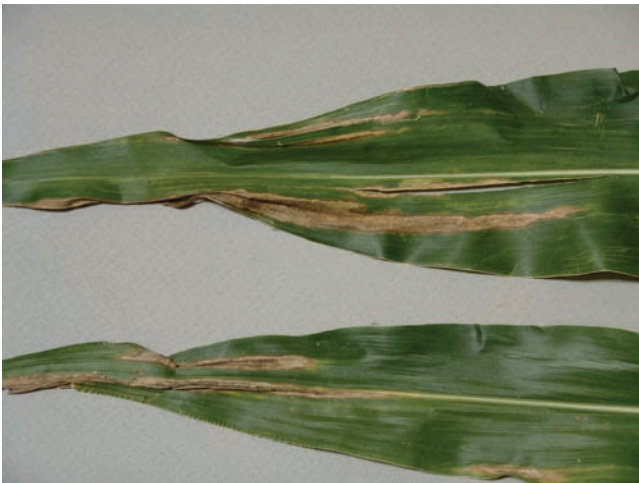
Figure 4. Water-soaked and wavy lesions following the veins are associated with the bacterial disease Stewart's wilt shown in both leaves above. Stewart's wilt can easily be confused with Goss's wilt, but lacks the green 'freckles' and shiny exudate on the surface.

and kill large portions of the canopy (Figure 3). Severe necrosis and dying tissue may be confused with leaf scorch symptoms, associated with drought stress or hot, drying winds. The water-soaked symptoms and lesions of Goss's wilt may be confused with those of another bacterial disease