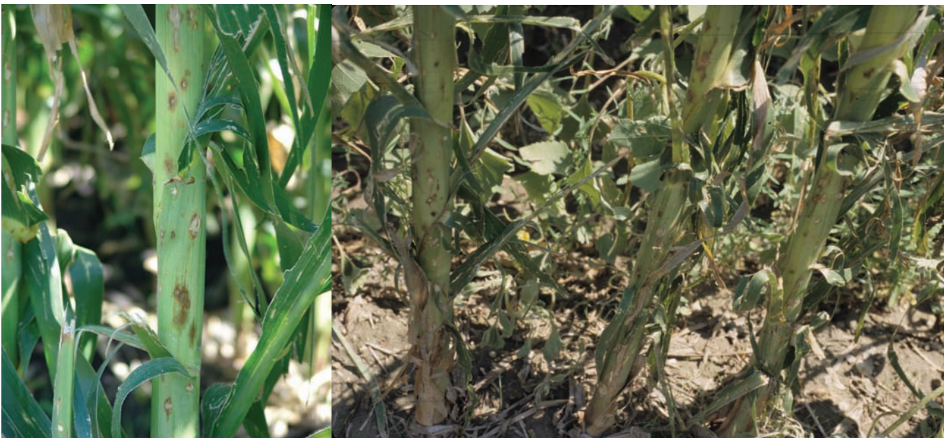
Figure 7. Wounds created by mechanical injury, especially stalk bruising (left) and leaf shredding (right) caused by hail, provide pathogen entry into the plant.

Yield losses in susceptible corn cultivars have been documented, from both the wilt and leaf blight phases of the disease. Thus, use of partially resistant hybrids is the best management strategy for Goss's wilt ( Figure 8 ). Several disease resistant hybrids are available, but less than 25 percent of seed corn companies in Nebraska currently publicize their hybrids' disease reactions to Goss's wilt and leaf blight. Furthermore, even in the event that resistance becomes widely available,