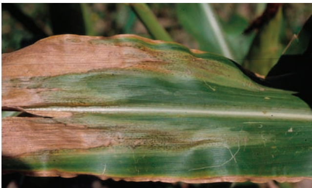
Figure 1. Small, dark discontinuous water-soaked spots or 'freckles' are one of the diagnostic symptoms and frequently develop near the edges of lesions associated with Goss's wilt and blight.

The pathogen can cause two major types of symptoms, a systemic wilt and leaf blight. The most commonly encountered symptom is leaf blight that appears as gray to light yellow lesions with wavy margins that follow the leaf veins. Prior to lesion development, characteristic streaks of water soaking can appear on the leaf. Dark green to black discontinuous, water-soaked spots resembling and often referred to as 'freckles' on the surface occur within the infected area and are diagnostic of the disease ( Figure 1 ). A bacterial exudate on diseased tissue that glistens and appears shiny in sunlight after drying ( Figure 2 ) is a sign of the foliar blight phase of the disease. Foliar lesions may progress to blight