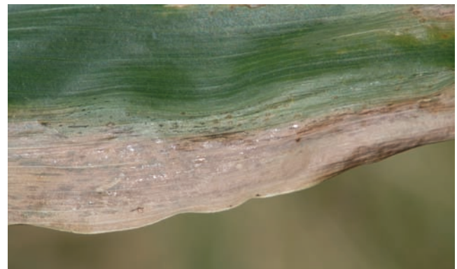
Figure 2. Bacterial exudate on the surface of leaves infected with Goss's wilt will often appear shiny.