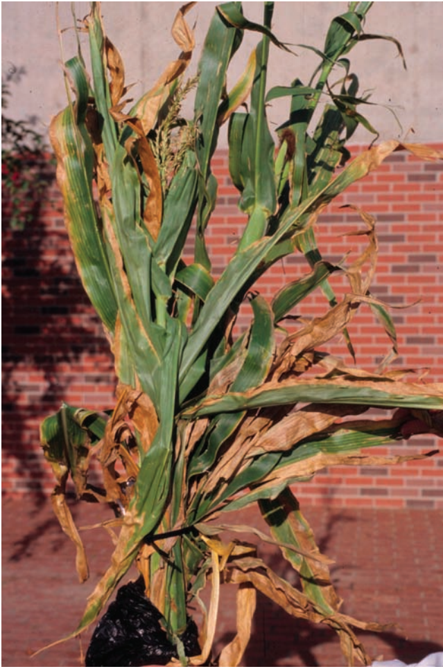
Figure 3. Goss's wilt and blight can progress to blight entire leaves over large areas of the canopy.